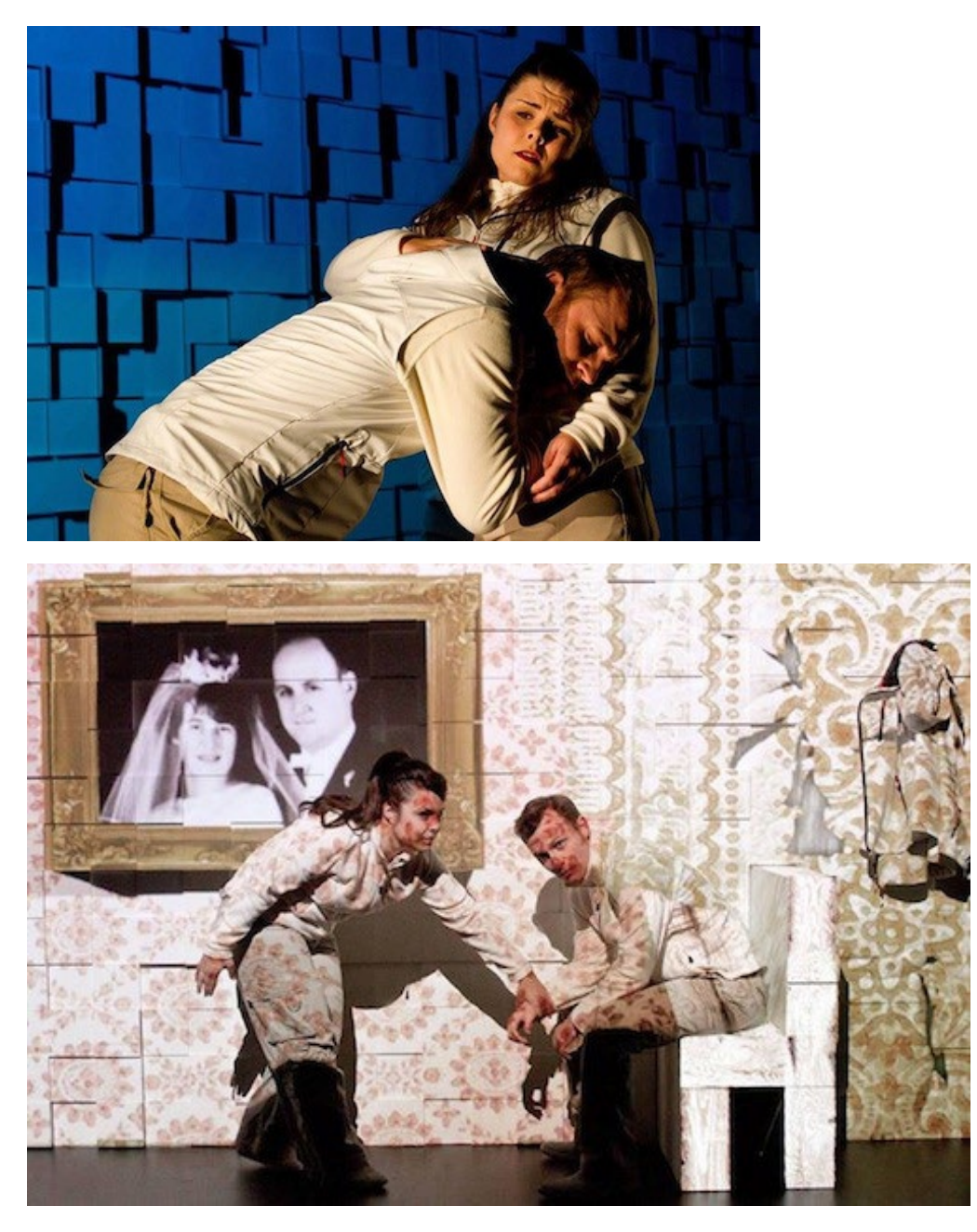
(From "Nokon kjem til å komme". Photo: Dietmar Janeck)