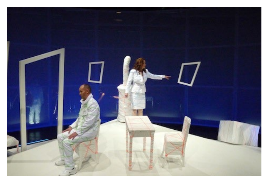
("Someone is going to come" performance in Kaiserslautern, Germany)